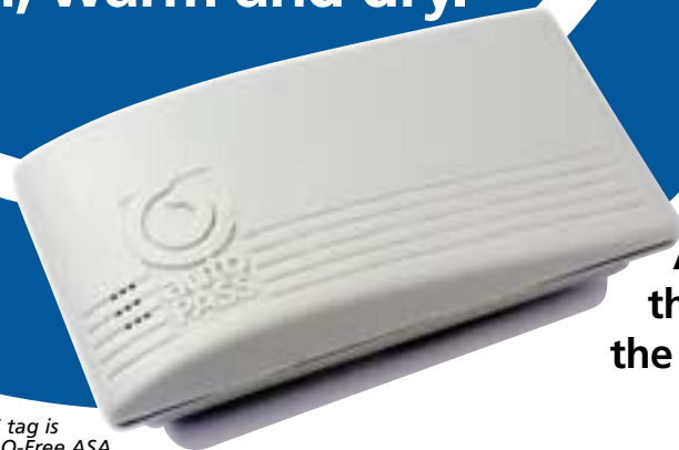
The AutoPASS tag is developed by Q-Free ASA.

Install the AutoPASS tag in the correct place. The windscreen must be clean, warm and dry.